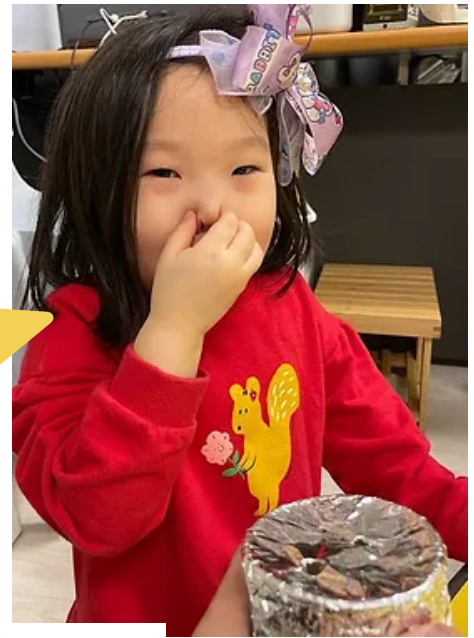
~Exploring God's gift of the 5 Senses~